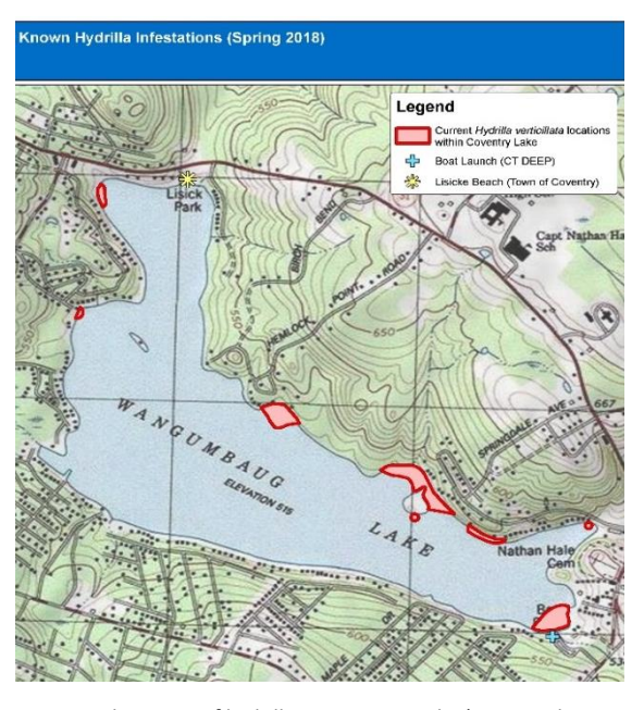
Known locations of hydrilla at Coventry Lake (Wangumbaug Lake). Boaters should avoid these areas noted with red to avoid fragmenting and spreading hydrilla.

STANLEY QUARTER PARK POND (drawdown). A 2-3 foot drawdown for dam repairs is ongoing. Accessing the water may be limited.