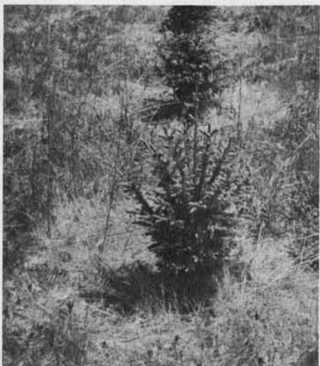
Figure 2. Directed sprays of paraquat, amitrole, or combinations of these with simazine are effectively applied after sod and weeds are actively growing, but before they have overtopped the trees.

prevented the growth reduction and mortality caused by dichlobenil. In another experiment carbon root dips reduced the injury caused by dichlobenil in seedlings of white spruce (3). Thus carbon root dips may allow the use of dichlobenil where otherwise it is hazardous to transplants.