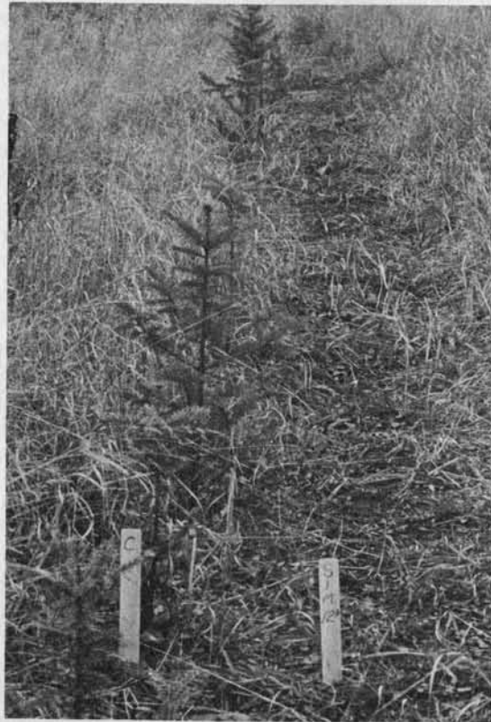
Figure 4. Off-center planting, which often results from planting into treated bands before the sod has started to die. The sod was sprayed with simazine plus paraquat one day and planted the next. Had planting been delayed a day or two, the treated strips would have been clearly defined and planting in the center of the treated area would have been assured.

Fall band treatments in northern New England are not practical where planting is done in the spring before sod growth has started in untreated areas, for greater effort is required to plant in the middle of treated bands that cannot be clearly seen. Similarly, treatments just prior to planting may not provide clearly defined bands (Fig. 4). If the sod is actively growing when treated with paraquat, visible strips result within a few days. The addition of colored dyes to herbicide sprays also has