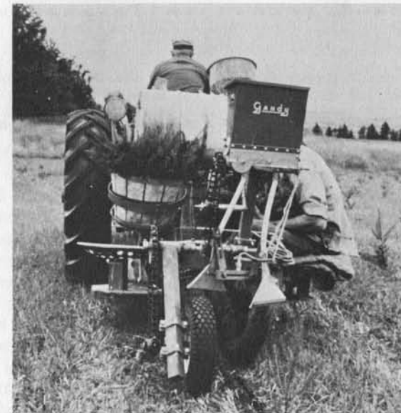
Figure 1. Types of granular applicators: Top, a 2-ft lawn spreader with 24-inch wheels made from ¾-inch exterior plywood, bolted to the original wheels; bottom, commercial granular applicator mounted on the planter. The granules flow only as the machine moves forward.

woody plants. Simazine persists in the soil but is slowly broken down by plants, by soil microorganisms, and also on soil or plant surfaces by light and/or evaporation to the atmosphere. It is only slightly soluble in water and, therefore, must be activated by rainfall following application.