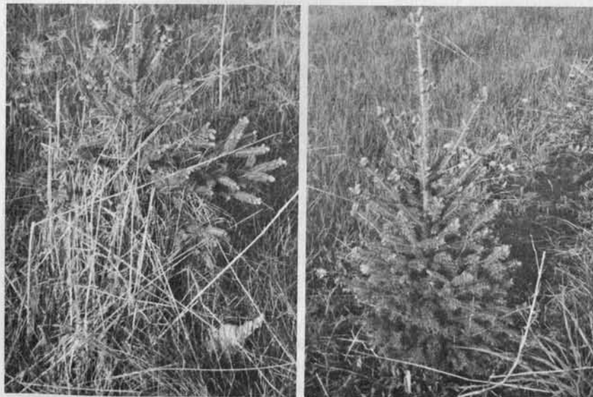
Figure 3. Unchecked sod shades trees, creating fire hazards and reducing quality of lower branches and vigor of the whole tree: Left, unchecked growth; right, treated bands in white spruce.

Sod control can benefit Christmas tree production if it achieves better survival, growth or form (quality) of trees. Clearly, our goals in sod control are to promote optimal response of the trees and not necessarily to kill all competing vegetation. Optimal tree response may be achieved